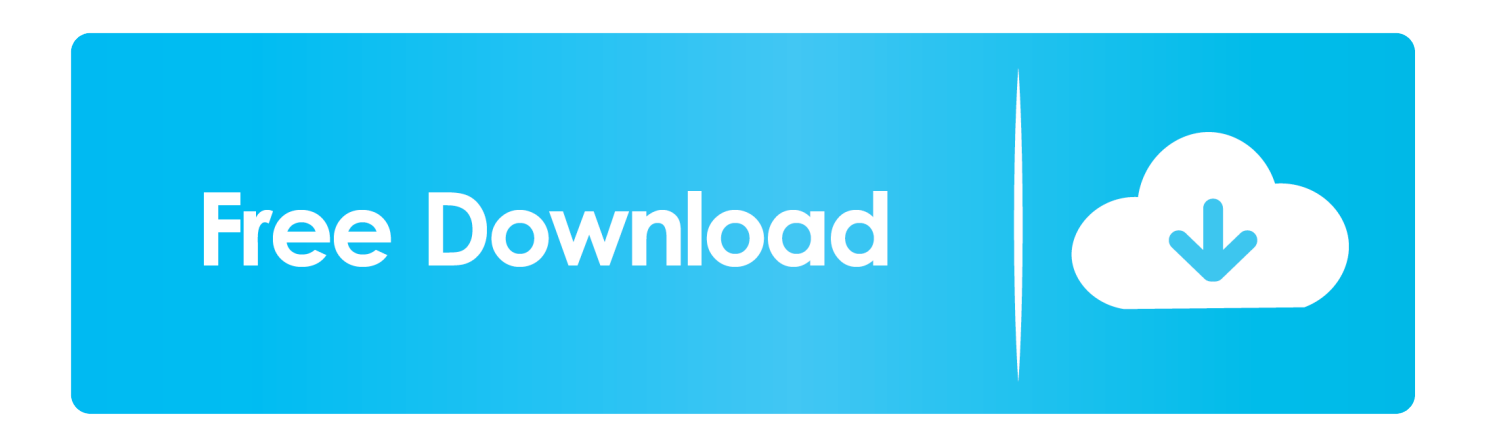
Facebook Account Hacker V.5.2.rar